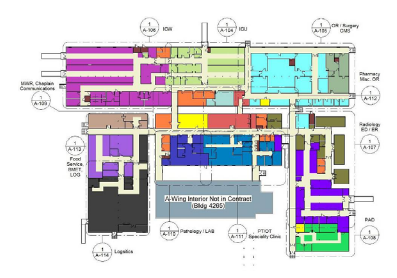
Figure 2 Departmental Adjacency Study

The re-design plans included plan views, sectional views, simple color delineated departmental adjacency plans (see Figure 2), 3D views from the various locations in the facility, a visual fly-through of a typical trauma patient from the ER through surgery and recovery to the intermediate care ward, mechanical pressurization requirements by room were indicated visually on the floor plans using color schemes. Additionally the model used color schemes to indicate individual room floor and ceiling materials, correlated color temperature (CCT) requirements, floor minimum structural strengths, and fire alarm zoning. The space allocations were computed automatically and sorted by department with less than 30 minutes of table set up time and virtually no calculations or updating required as the concept for the new plan evolved. The earlier 2D effort had only been completely validated against the authorized program once during the three years of the evolving conceptual design. Due to the amount of time required to validate the authorized space program to that of the non-BIM design, it was only spot checked to ensure a relative compliance. This illustrates some of the value of the data driven architectural BIM, specifically the ability to easily develop multiple views and the ability to query accurate information from the model.