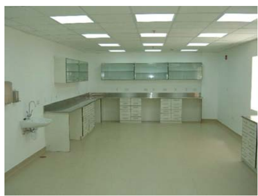
2007 Constructed Facility