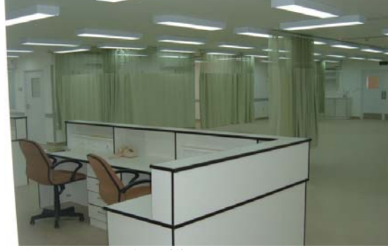
2007 Constructed Facility