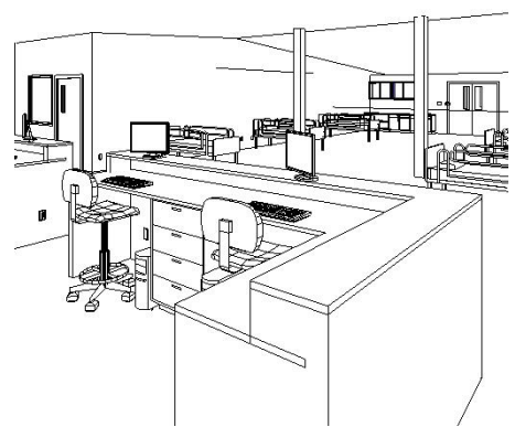
2006 Schematic BIM Model

planning, allowed time during the DB execution stage to be focused on additional details versus limited to trying to establish a common baseline. Casework modifications later were minimal and related to building type changes (from modular pre-fabrication to a pre-engineered steel structure).