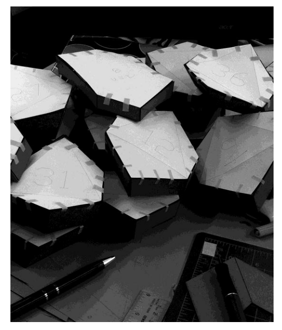
FIG. 3: Bees Knees honeycomb cells.

The final fabrication process incorporated the 3D printer, which was well suited for the structure due to its rigidity and accuracy (Figure 2, center). Using the 3D printer is not practical for producing the entire model due to the size requirements of the final product and the limitations of the 3D printer bed size. Following several prototypes to rationalize the geometry for the fabrication process of this doubly curved surface, work began on the final model.